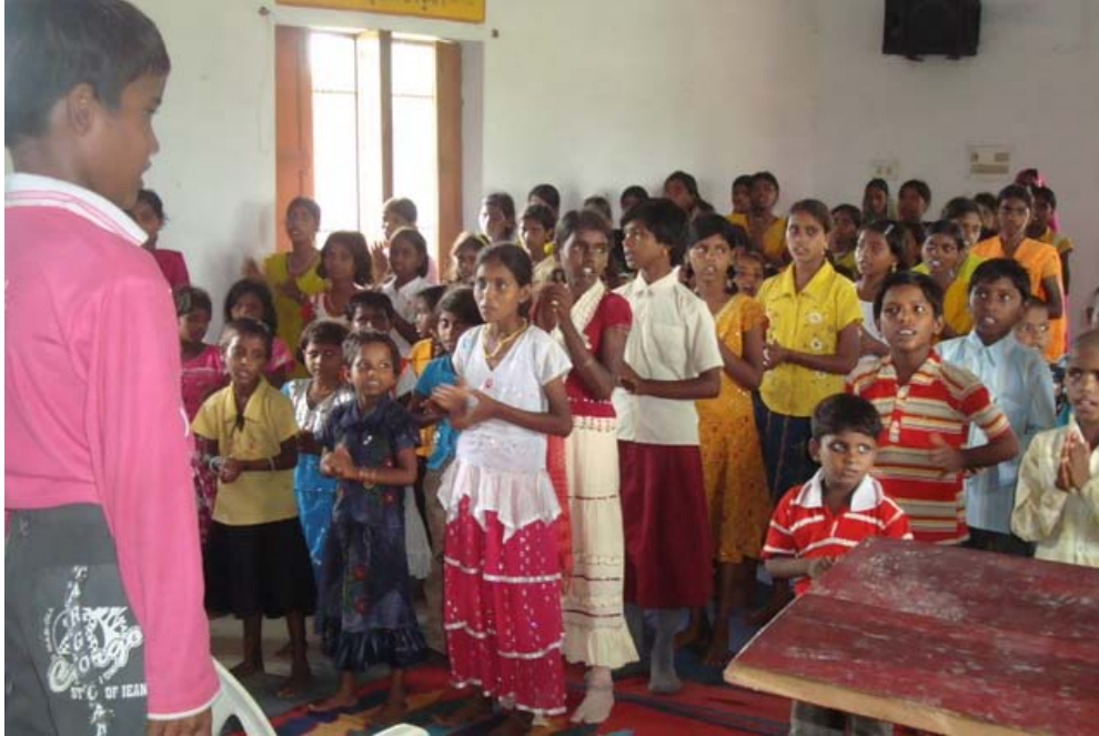
Children learn to lead in prayer at the Education Center in Chandauli, Varanasi District.