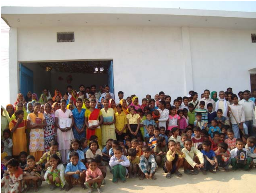
Children with their parents at a parent-teacher meeting at the village of Shihorwa.