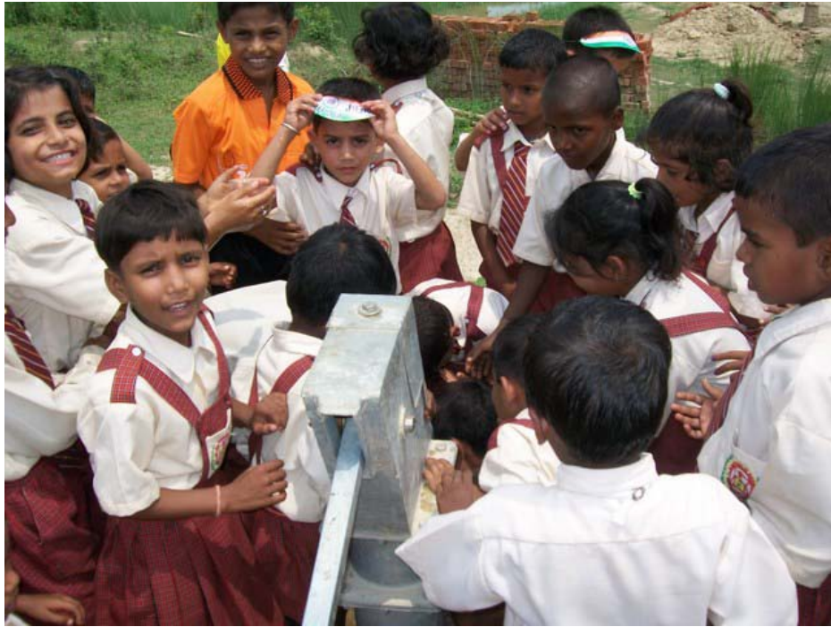
Children from other schools interacting with our children at the village of Murdi