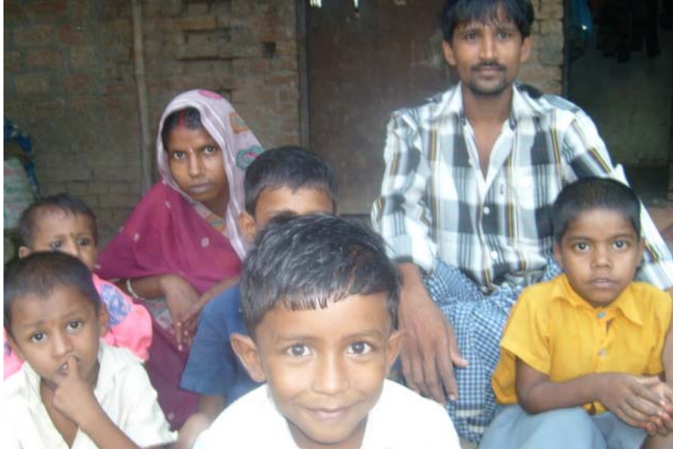
This family came to know Jesus Christ through their children, who shared the Gospel with them after participating in the Education Center at the village of Hatiya, Varanasi District.