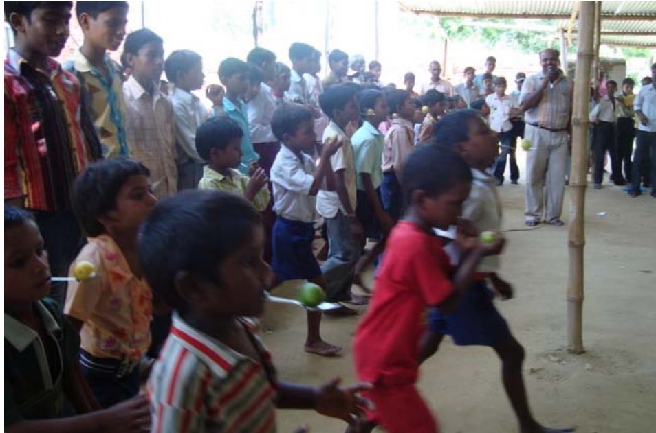
Some of the Education Centers incorporate games. This is the center at the village of Kuddupur, Jaunpur District.