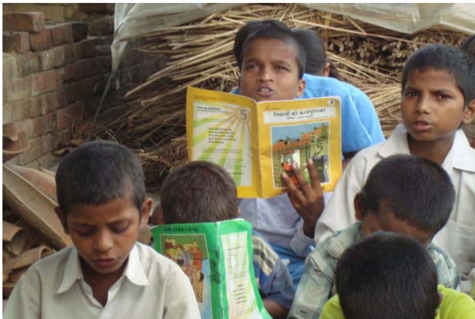
Teaching children the Word of God using Bible comics and other material provided by Sewa Bharat.