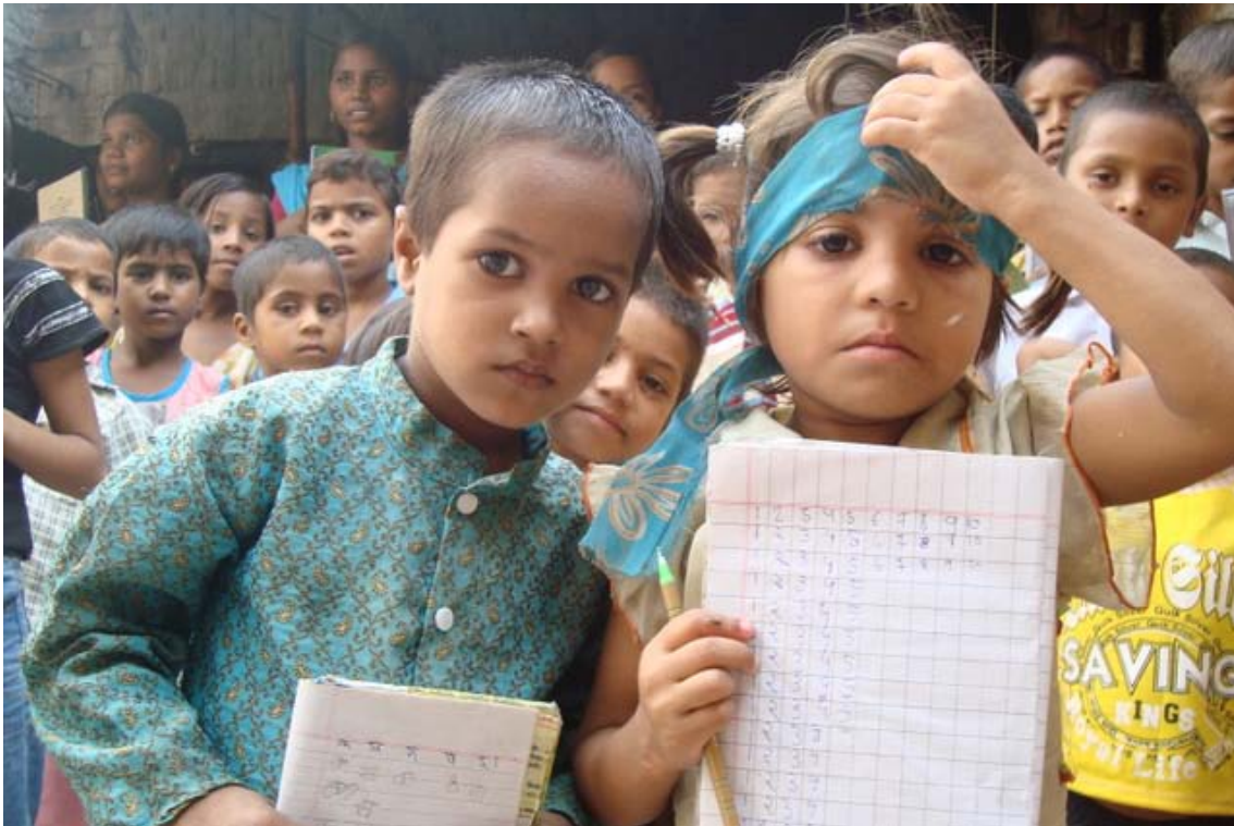
Showing off their numbers.