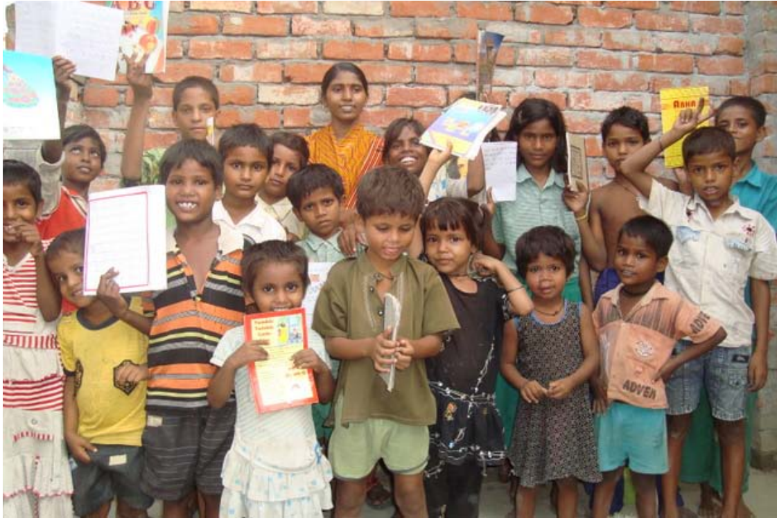
Partner agency New Life Fellowship working with our children at the village of Harhua.